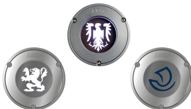
Votre visuel, personnalisable sur demande