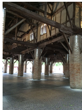
8 barreaux LEC 5633-Arches-BE6-L3 en blanc chaud sur le colombage du haut

Application fields LEC in the heart of town