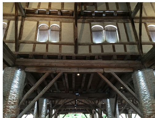
18 barreaux LEC 5634-Stripe-CW6-3W en blanc froid sur les fenêtres intérieures du colombage

Application fields LEC in the heart of town