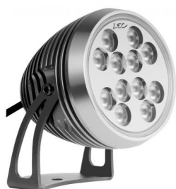
Adjustable on 2 axis