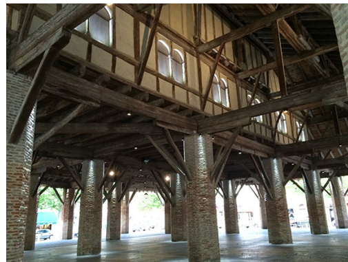
144 projecteurs LEC 4020-Luminy 2-CW-10-3W en blanc froid anodisés noir sur les piliers par le haut.